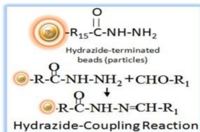
Fig.1 Hydrazide coupling reaction

The kit produces affinity support with glycoproteins and antibodies using hydrazide-activated magnetic beads and a specific catalyst. Monoclonal antibodies and glycosylated proteins can be immobilized using periodate-oxidizable carbohydrate groups to create reusable affinity matrices. This hydrazide immobilization chemistry yields antibodies with unobstructed antigen-binding sites and excellent purification capacity. The full coupling reaction takes 2 to 4 hours in a simple non-amine buffer containing the catalyst. Antibodies and common glycoproteins show coupling efficiency typically greater than 85%, yielding 15µg to 20 µg of immobilized protein per mg of the hydrazide-terminated magnetic beads. The matrix prepared with stable glycoproteins or antibodies can be regenerated and reused at least five times without appreciable loss of binding capacity.