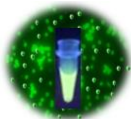
Fig.1 BcMag™ Terbium Fluorescence Magnetic Beads

BcMag™ Streptavidin-Terbium Fluorescence Magnetic Beads (Fig.1) are Time-Resolved Fluorescence (TRF) magnetic microspheres covalently coupled with streptavidin protein. The beads are manufactured using nanometer-scale superparamagnetic iron oxide and terbium metal as core and entirely encapsulated by a high-purity silica shell, ensuring no leaching problems with the iron oxide and europium metal. The microspheres combine the benefits of a novel streptavidin biotin-binding method, time-resolved Fluorescence dyes, and magnetic characteristics to perform very sensitive assays.