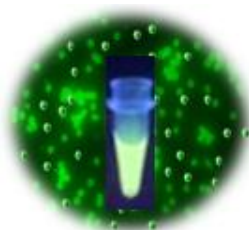
Fig.1 BcMag™ Terbium Fluorescence Magnetic Beads

BcMag™ Avidin Terbium Fluorescence Magnetic Beads (Fig.1) are Time-Resolved Fluorescence (TRF) magnetic microspheres covalently coupled with avidin protein. The beads are manufactured using nanometer-scale superparamagnetic iron oxide and terbium metal as core and entirely encapsulated by a high-purity silica shell, ensuring no leaching problems with the iron oxide and europium metal. The microspheres combine the benefits of a novel avidin biotin-binding method, time-resolved Fluorescence dyes, and magnetic characteristics to perform very sensitive assays.